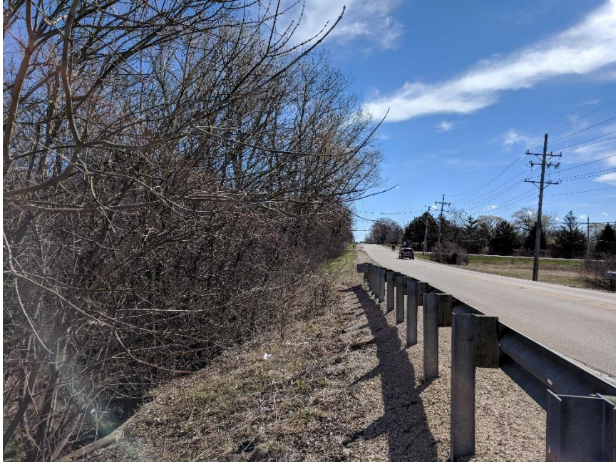
Ackman Rd, between Redtail Dr & Swanson Rd Non-recoverable, unprotected foreslope on approach to culvert hazard