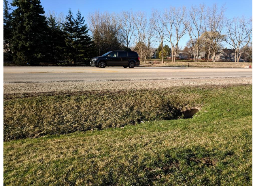
Ackman Rd, between Golf Course Rd & Westport Ridge Non-traversable culvert end section in clear zone (remove obsolete driveway)