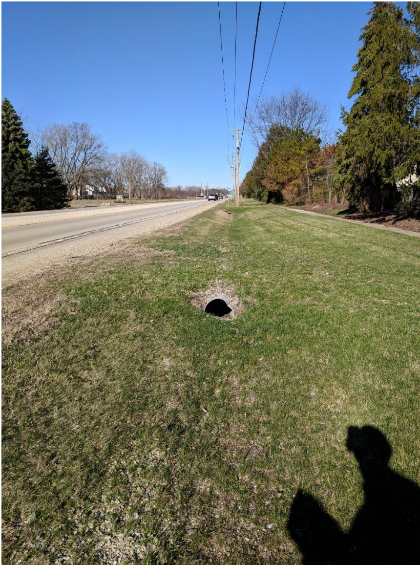
Ackman Rd, between Golf Course Rd & Westport Ridge Non-traversable culvert end section in clear zone (remove obsolete driveway)