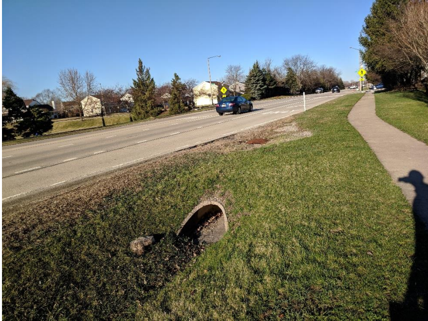
Ackman Rd, between Westport Ridge & Crimson Dr Non-traversable culvert end section in clear zone