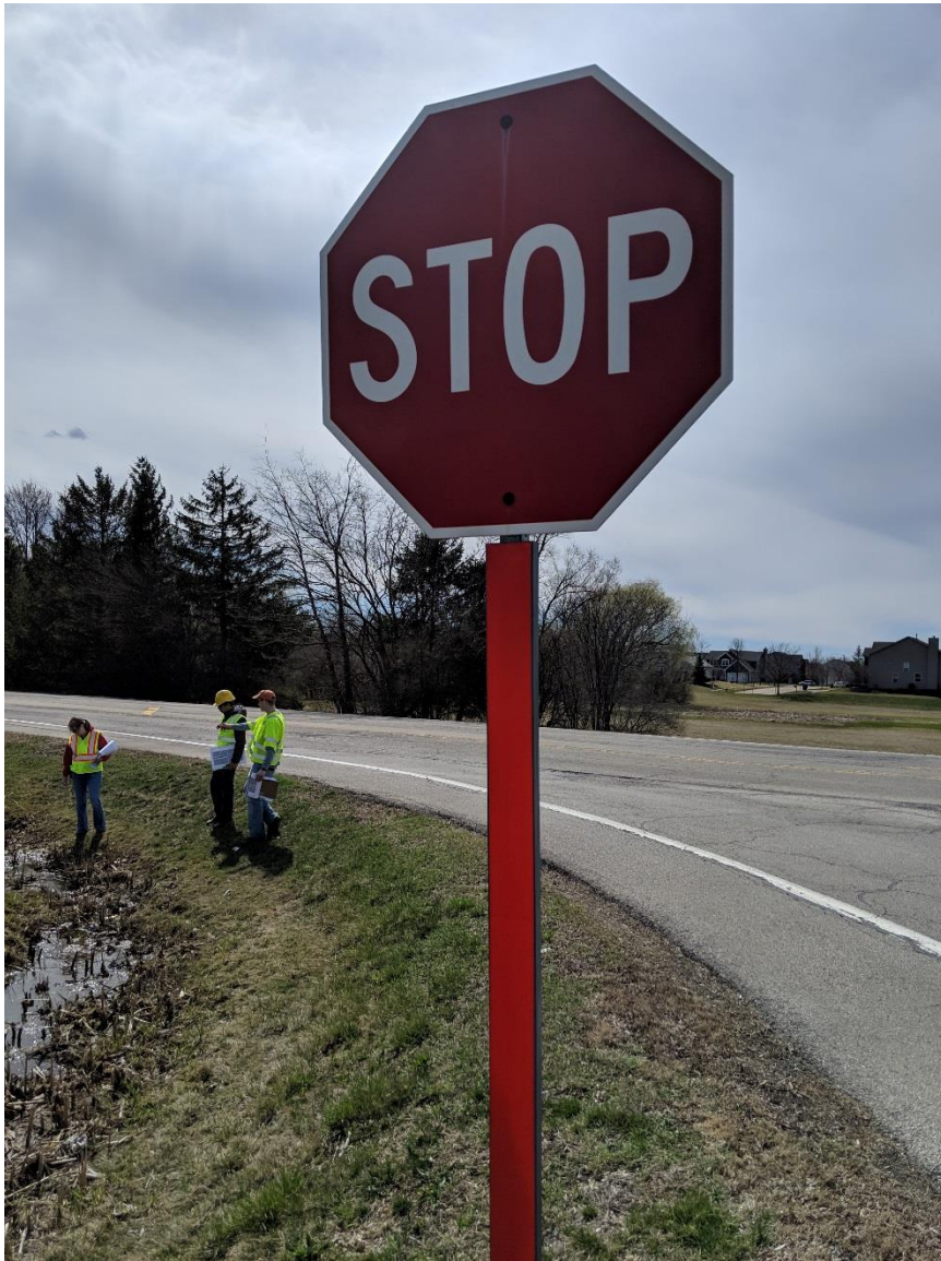
Haligus Rd & Ackman Rd, SE Corner Critical foreslope and unfavorable ditch section