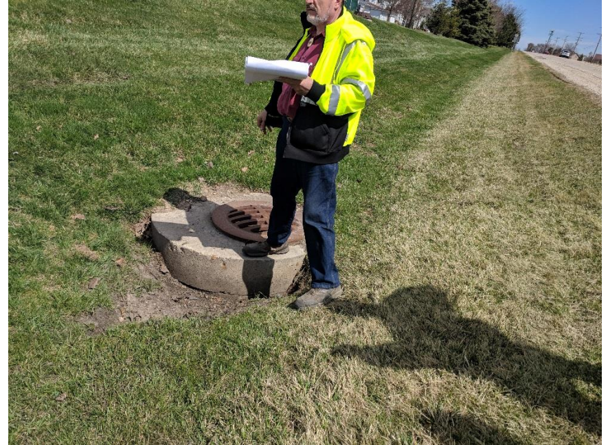
General Notes: Various non-traversable drainage structures with eroded ground