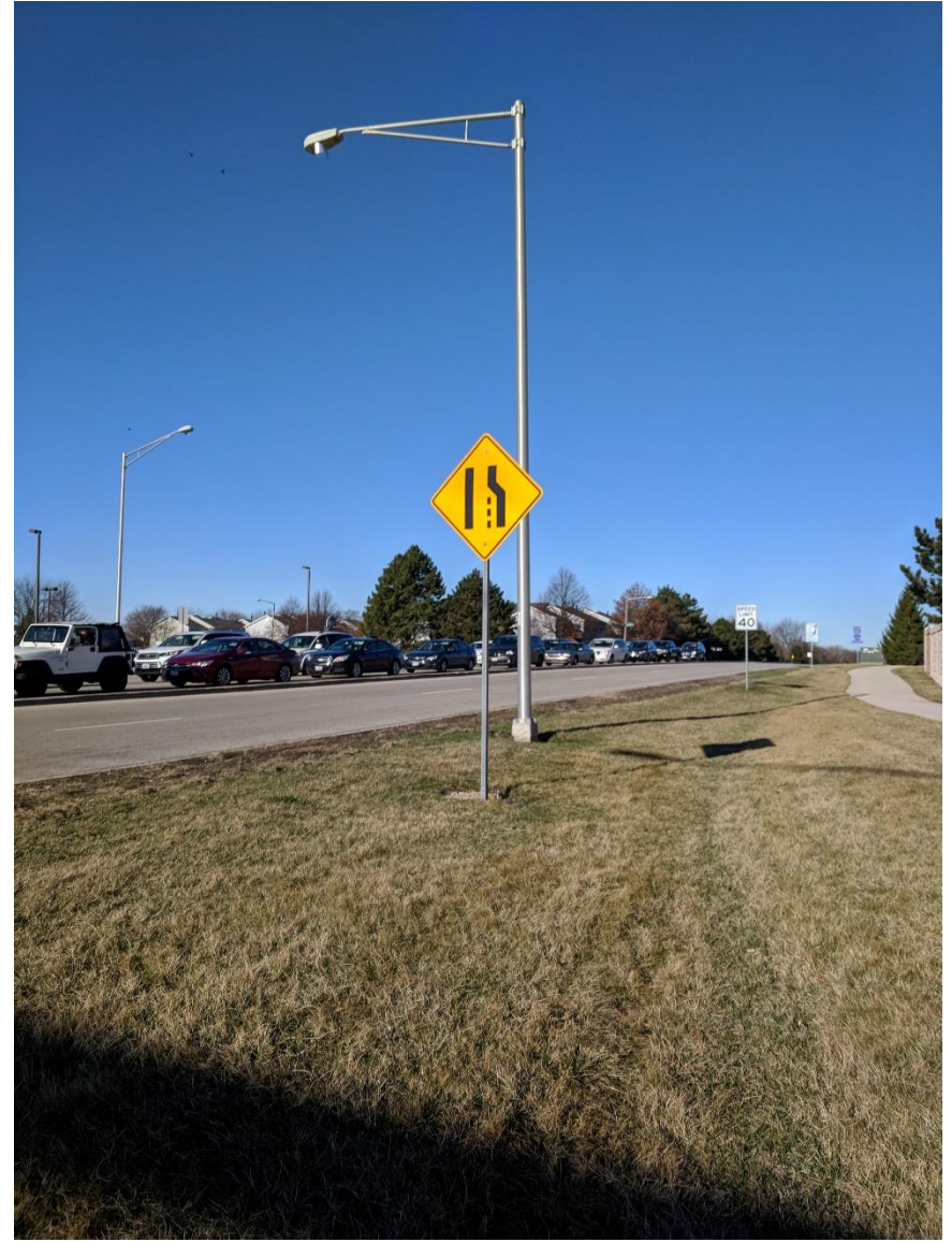
Ackman Rd, between Skyridge Dr and Randall Rd Remove incorrect application of lane drop (W4-2) sign