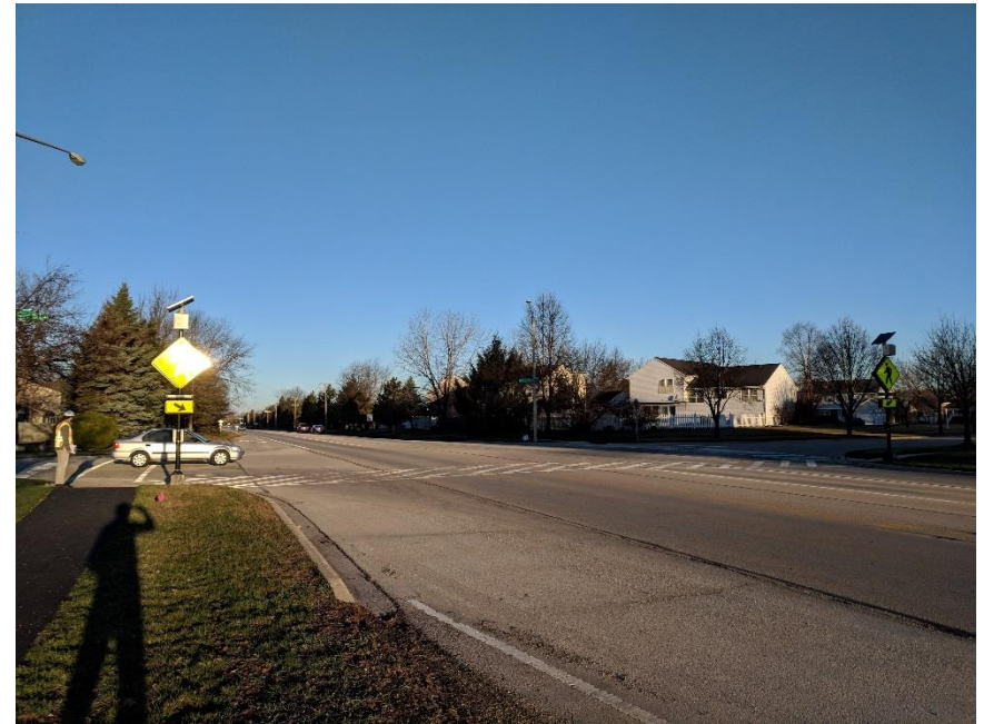
Westport Ridge & Ackman Rd Excessive glare observed during sunrise and sunset hours at mid-block crossing equipped with rectangular rapid-flashing beacon, limiting the visibility of the signs and flashing beacons.