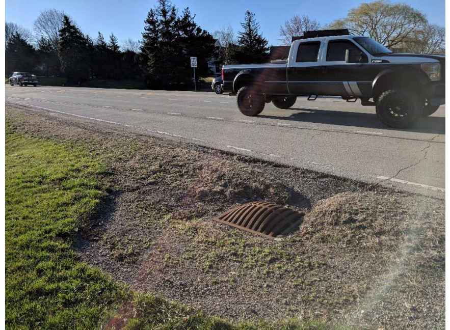
Ackman Rd, between Westport Ridge & Crimson Dr Non-traversable drainage structure in clear zone