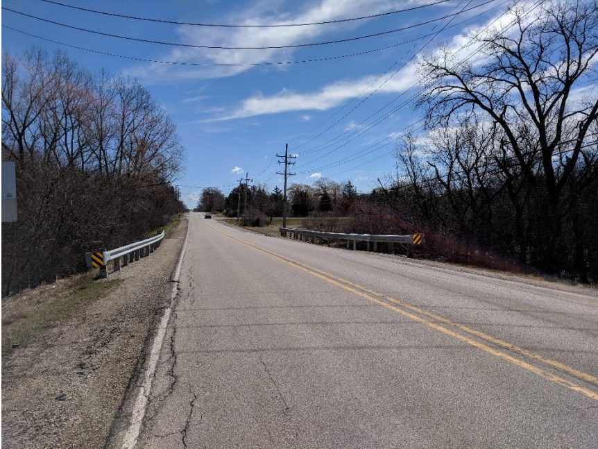
Ackman Rd, between Redtail Dr & Swanson Rd Guardrail limits do not cover length of need for culvert and foreslope hazards.