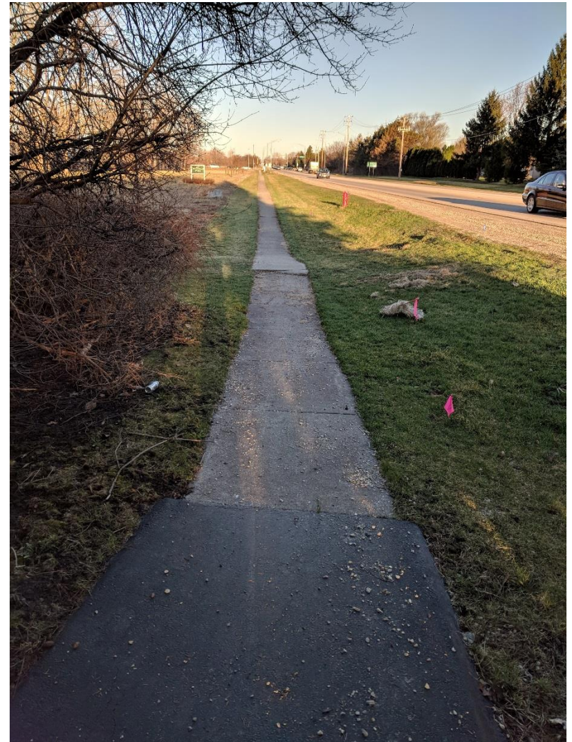
Ackman Rd, between Golf Course Rd & Westport Ridge Bike Connectivity: Multiuse path terminates to sidewalk on midblock, short of bike lanes on Golf Course Rd