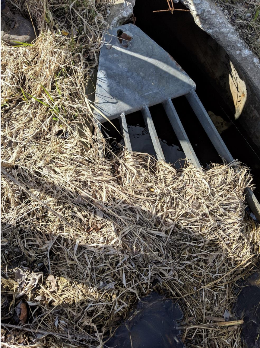
Ackman Rd, between Swanson Rd & Huntley Rd (and other locations) Undersized grate on culvert end section