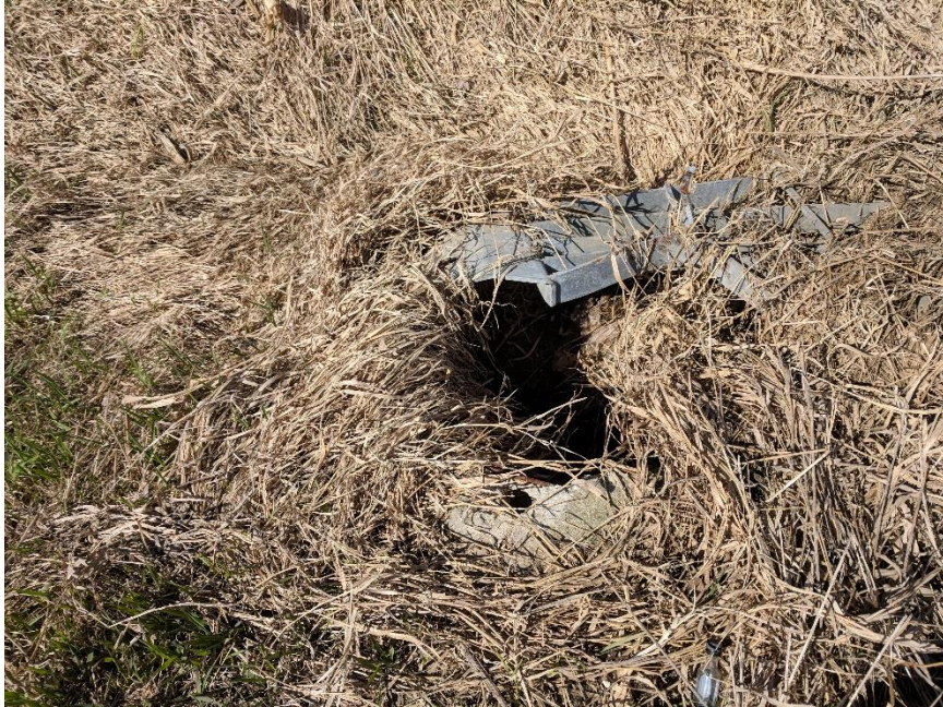
General Notes: Various non-traversable drainage structures with undersized or missing grates within clear zone