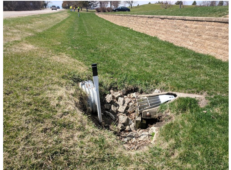
Ackman Rd, between Albrecht Rd & Redtail Dr Non-traversable culvert end section with steep grades and eroded ground