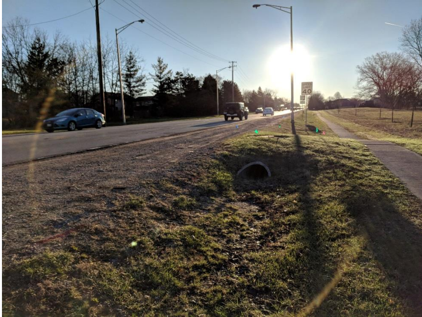
Ackman Rd, between Golf Course Rd & Westport Ridge Utility pole and non-traversable culvert end section potentially within clear zone