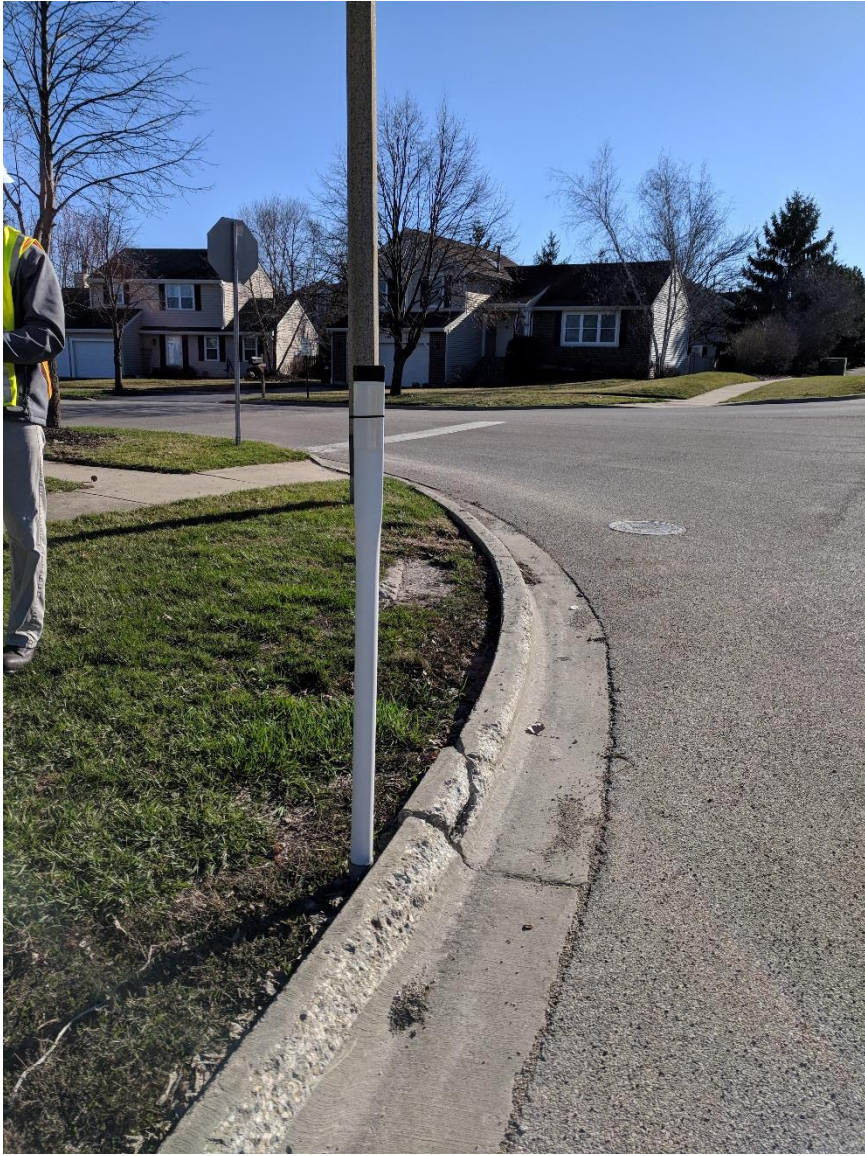
Crimson Dr & Ackman Rd Broken curb at NW corner radius