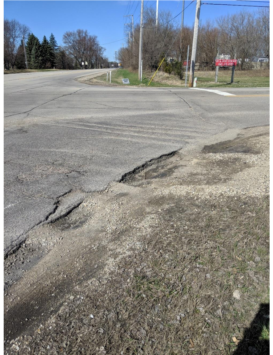
Huntley Rd & Ackman Rd Edge of pavement damaged at corner radii