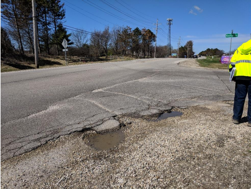
Redtail Dr & Ackman Rd Edge of pavement damaged at corner radii