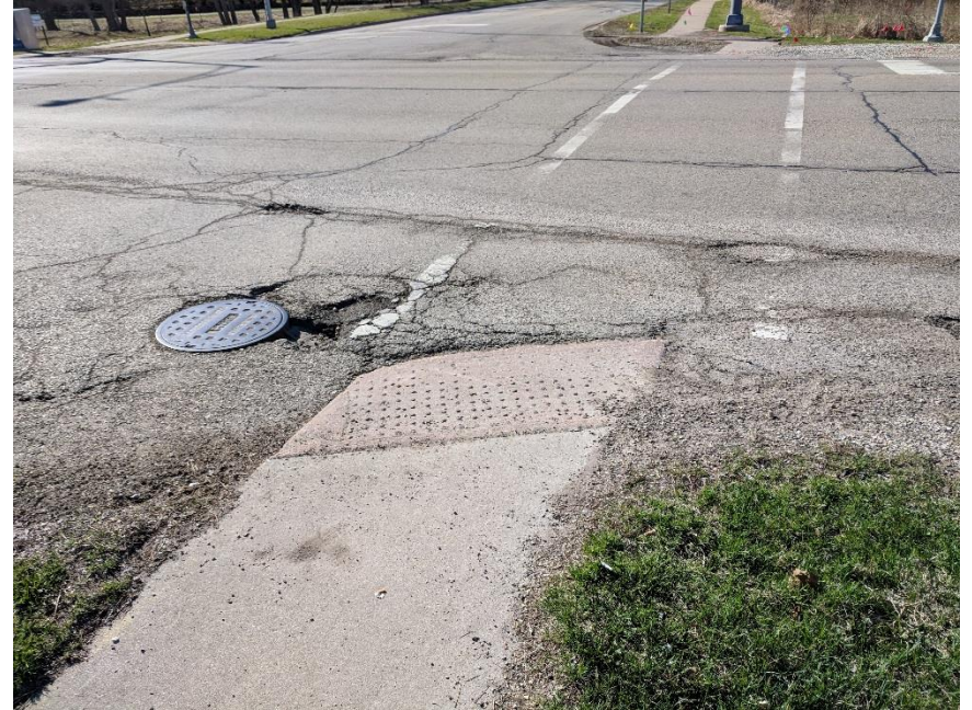
Golf Course Rd & Ackman Rd ADA ramp tiles located within pavement limits in NW corner