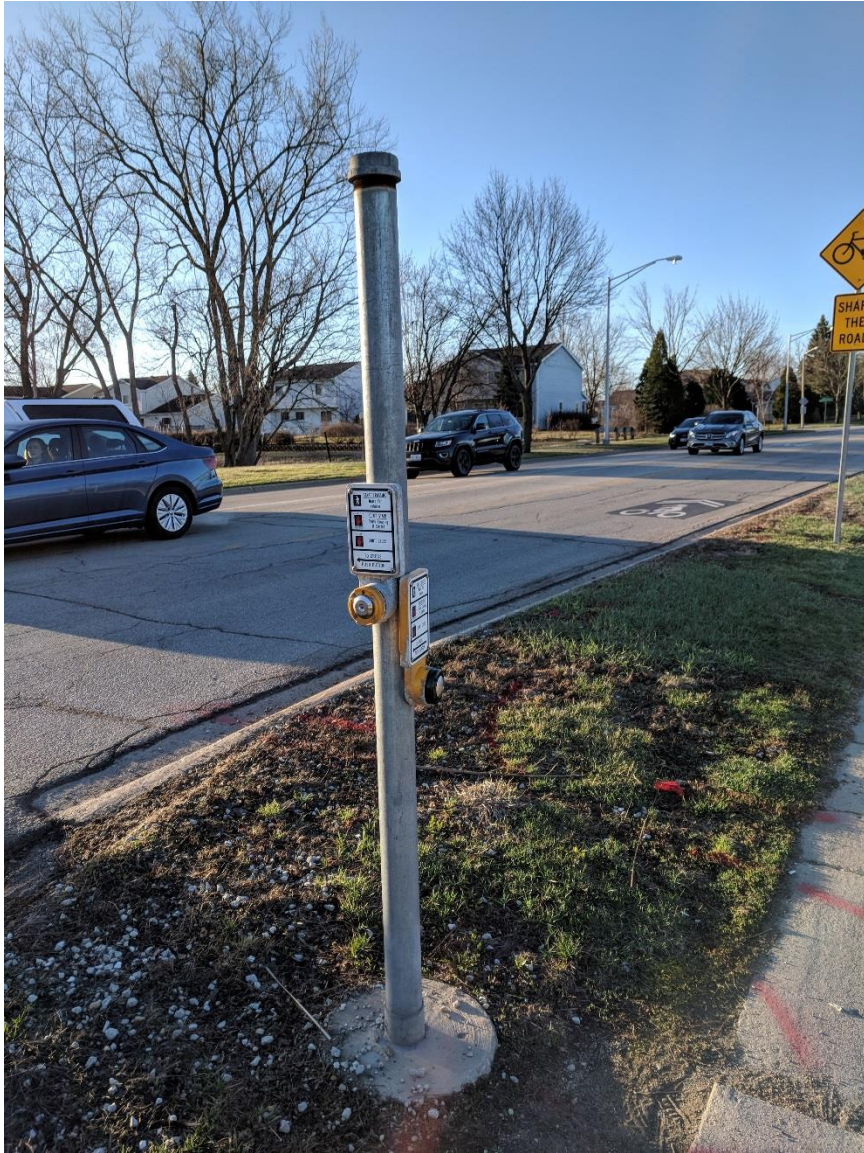
Golf Course Rd & Ackman Rd Non-functional push button in SW corner