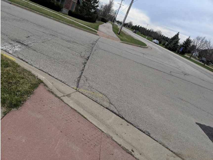
Ronan Ct & Ackman Rd No crosswalk pavement markings, worn ADA tiles (TYP)