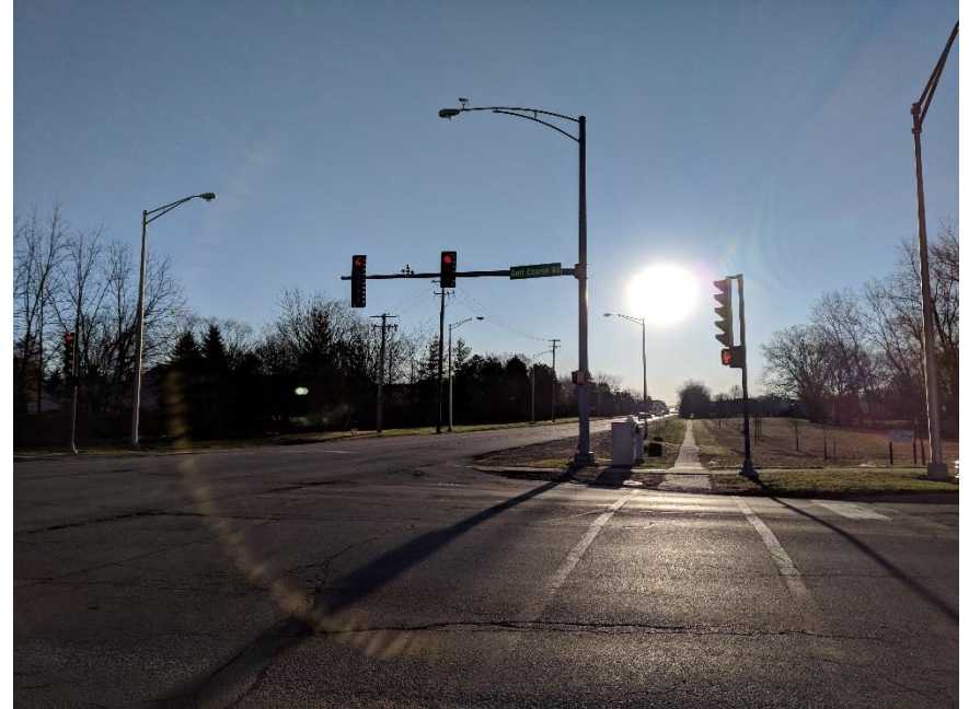
Golf Course Rd & Ackman Rd

Edge of pavement damaged at corner radii and Intersection pavement in poor condition (pot holes, depressions and pavement cracking)