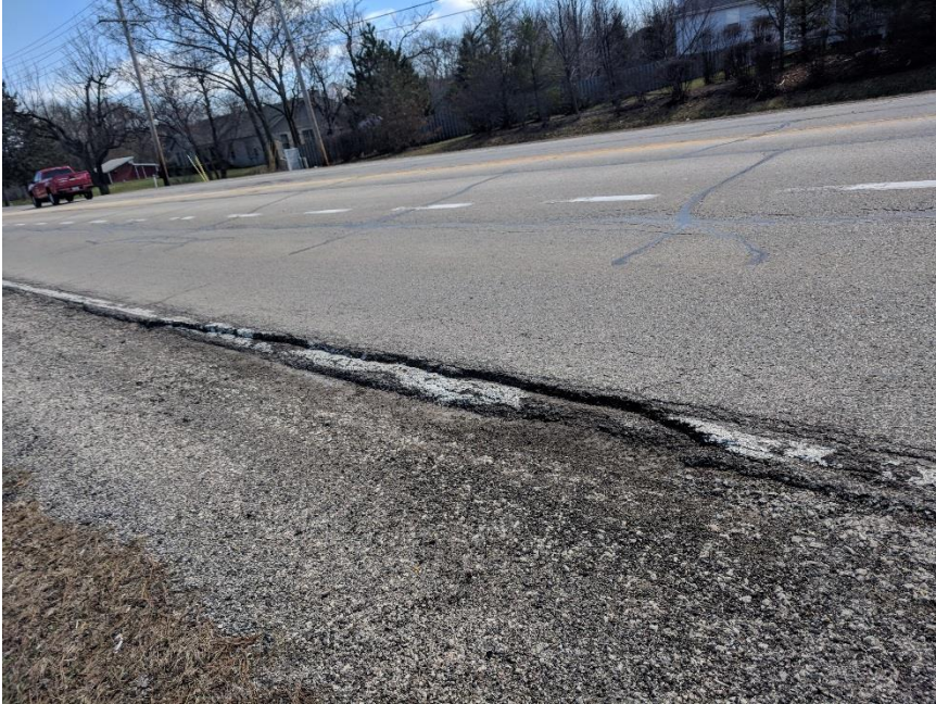
General Notes: Edge of pavement on Ackman Rd Damaged or broken at various segments adjacent to gravel shoulders