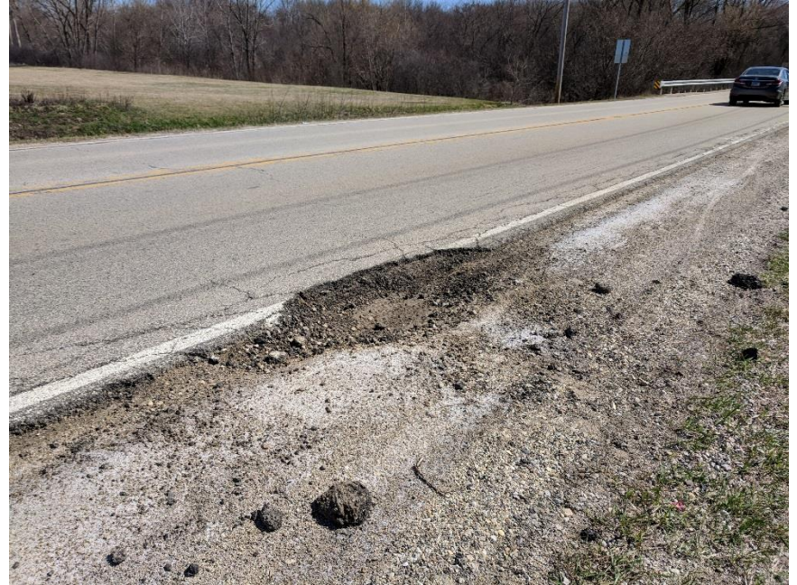
Redtail Dr & Ackman Rd Edge of pavement damaged