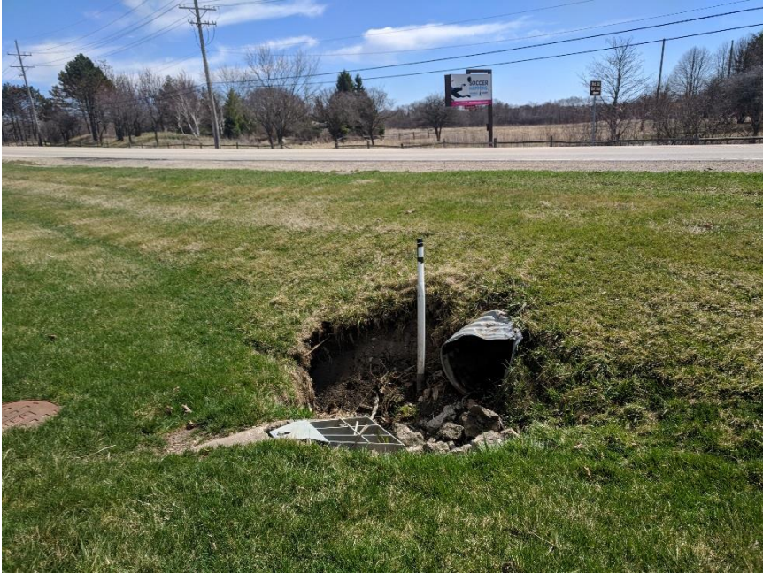
Ackman Rd, between Albrecht Rd & Redtail Dr Non-traversable culvert end section with steep grades and eroded ground