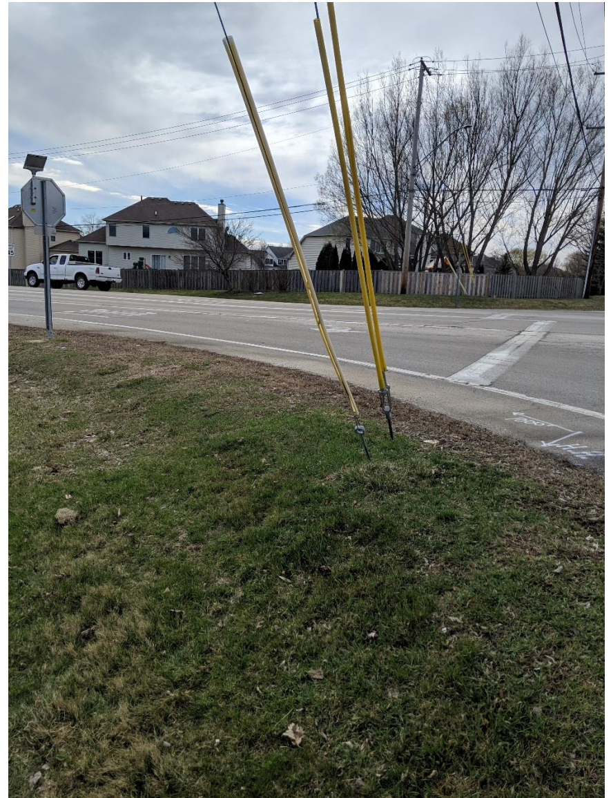
Lakewood Rd & Ackman Rd, SE Corner Utility pole guy wire in clear zone