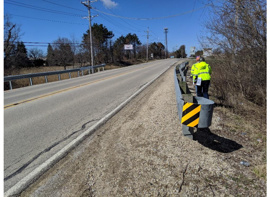
Ackman Rd, between Redtail Dr & Swanson Rd Terminals do not meet current standards.