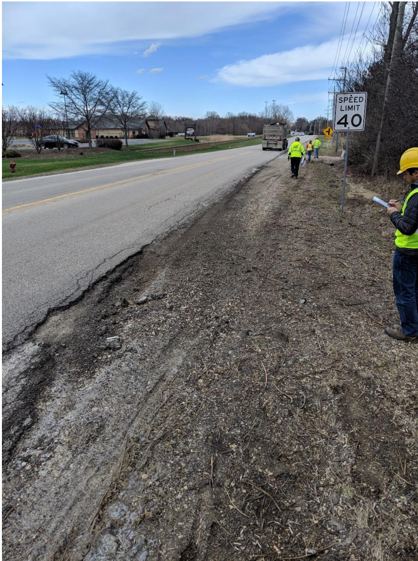
Ackman Rd, between Albrecht Rd & Redtail Dr Damaged EOP