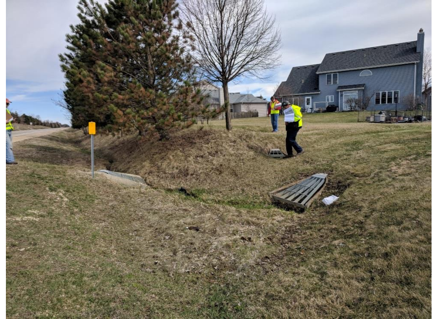
General Notes: Various non-traversable culvert end sections not flush with adjacent ground