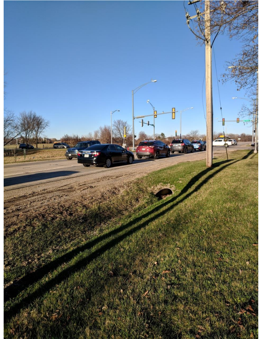
Golf Course Rd & Ackman Rd Utility pole and non-traversable culvert end section potentially within clear zone