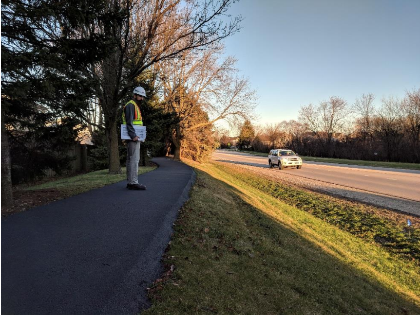
Ackman Rd, between Westport Ridge & Crimson Dr Non-recoverable foreslope adjacent to multi-use path