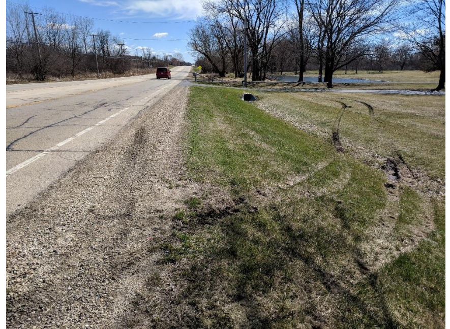
Huntley Rd & Ackman Rd Off-road tire marks observed, starting at approximately 30 ft east of the intersection of Huntley Rd & Ackman Rd . Possibly from loss of control during a southbound left-turn maneuver.