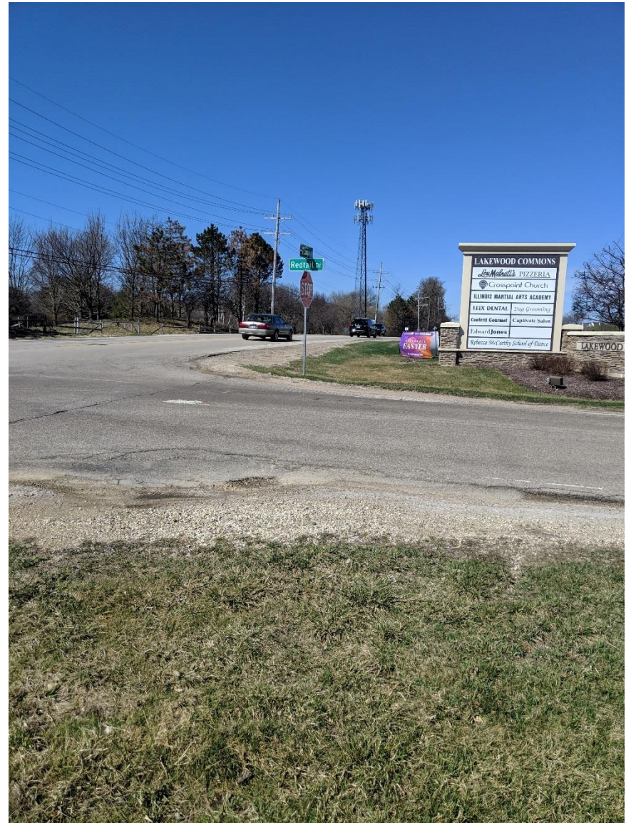
Redtail Dr & Ackman Rd Edge of pavement damaged at corner radii