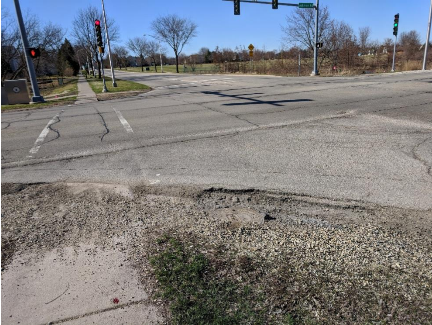
Golf Course Rd & Ackman Rd

Edge of pavement damaged at corner radii and Intersection pavement in poor condition (pot holes, depressions and pavement cracking)