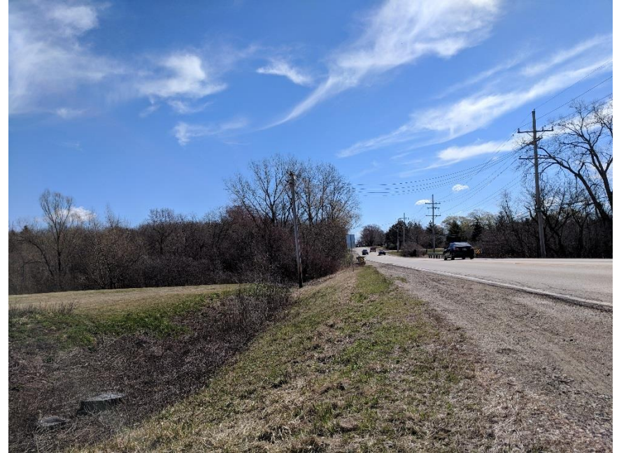
Ackman Rd, between Redtail Dr & Swanson Rd Non-recoverable, unprotected foreslope adjacent to culvert hazard