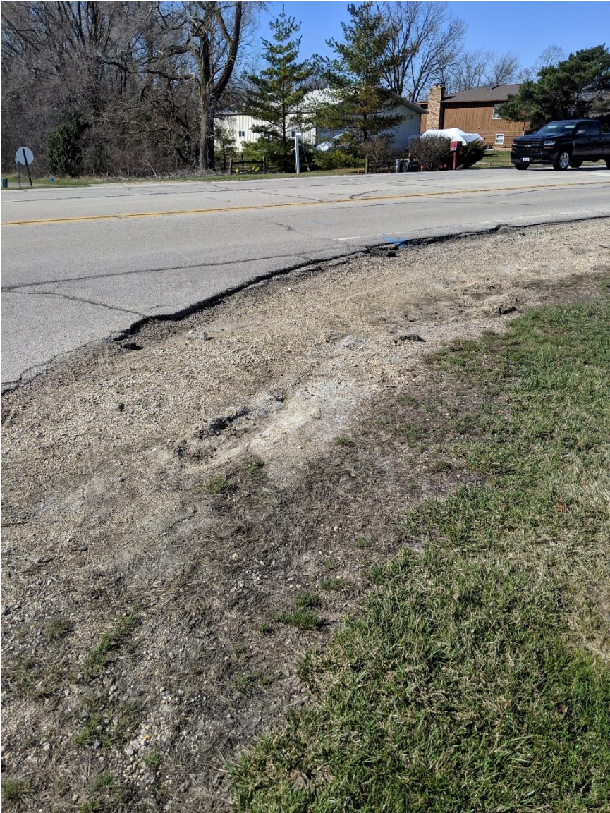
Amberwood Rd & Ackman Rd Edge of pavement damaged at corner radii