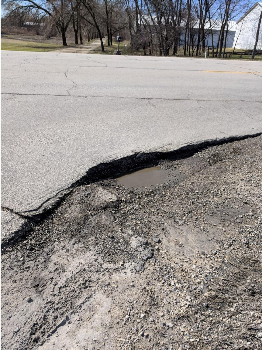
Huntley Rd & Ackman Rd Edge of pavement damaged at corner radii