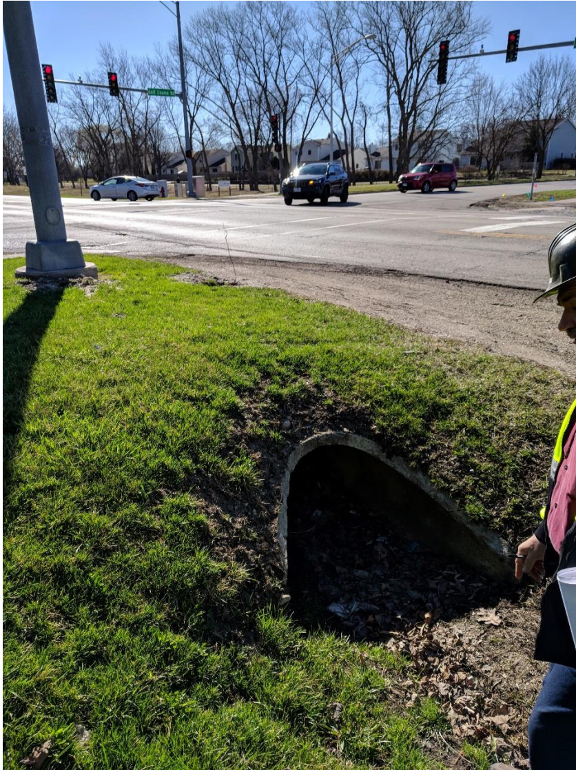
Golf Course Rd & Ackman Rd Non-traversable culvert end section in clear zone