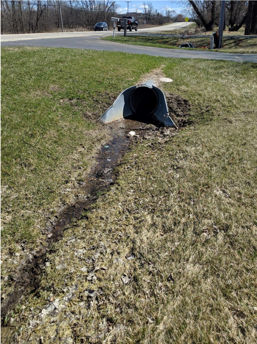
Ackman Rd, between Huntley Rd & Amberwood Rd Non-traversable culvert end section in clear zone